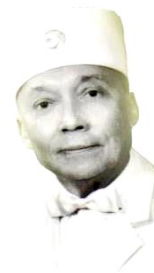
The Honorable Elijah Muhammad Last Messenger of Allah (God)

In the Name of Allah, the Most Gracious, the Most Merciful